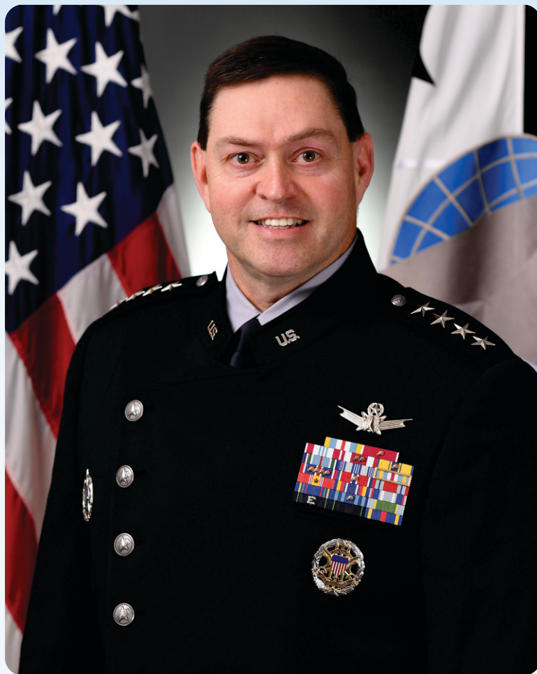
GENERAL B. CHANCE SALTZMAN Chief of Space Operations, United States Space Force