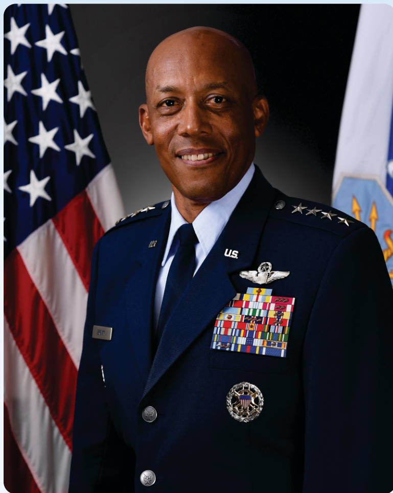
GENERAL CHARLES Q. BROWN, JR. Chief of Staff, United States Air Force